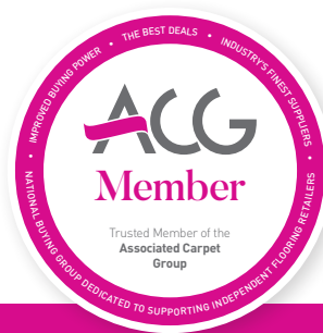
ACG Member and Accredited Retailer Window and Vehicle Vinyls