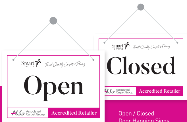
Open / Closed Door Hanging Signs