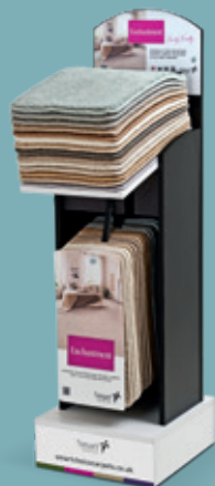
Smart Choice Slimline Lectern W: 361mm H: 1350mm D: 400mm