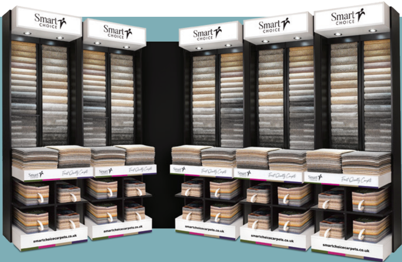
Smart Choice Wall Units W: 743mm H: 2290mm D: 538mm

Our new Smart Choice Displays give our members showrooms uniformity and consistency, showcasing the finest core selling ranges from the best suppliers in the industry.