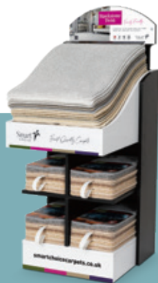
Smart Choice Lectern W: 500mm H: 1330mm D: 730mm