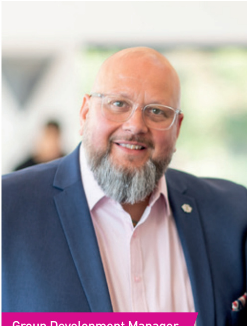
Group Development Manager