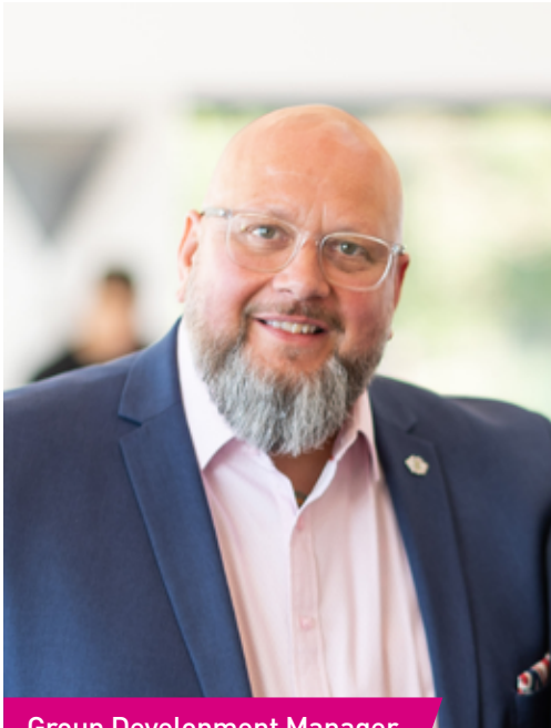
Group Development Manager