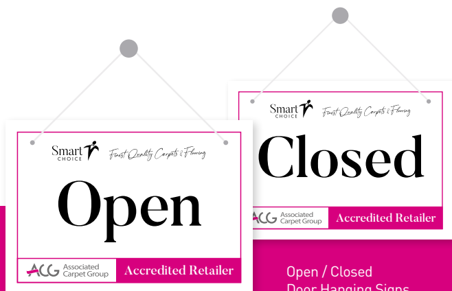
Open / Closed Door Hanging Signs