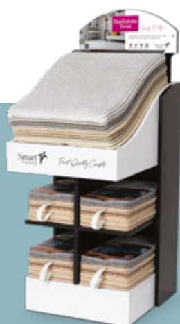
Smart Choice Lectern W: 500mm H: 1330mm D: 730mm