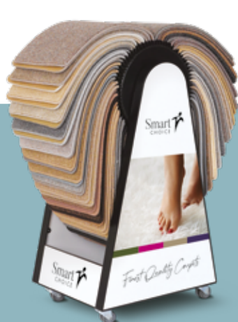
Smart Choice Tombola W: 550mm H: 1070mm D: 450mm