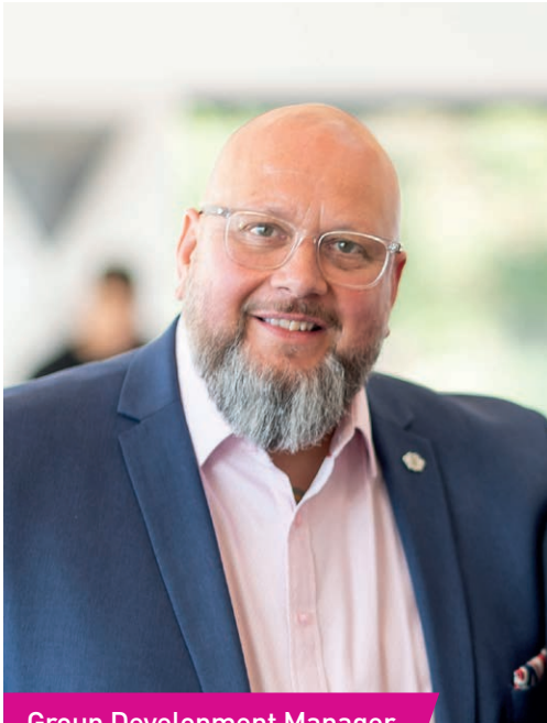
Group Development Manager