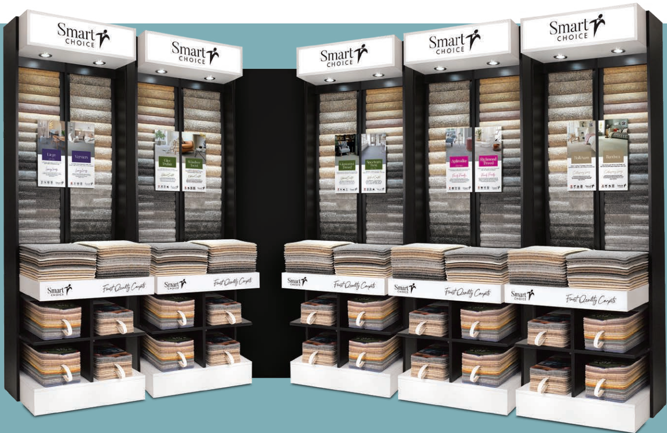
Smart Choice Wall Units W: 743mm H: 2290mm D: 538mm

Our new Smart Choice Displays give our members showrooms uniformity and consistency, showcasing the finest core selling ranges from the best suppliers in the industry.