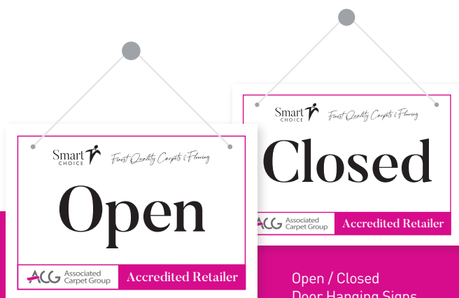
Open / Closed Door Hanging Signs