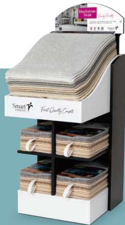
Smart Choice Lectern W: 500mm H: 1330mm D: 730mm