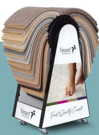
Smart Choice Tombola W: 550mm H: 1070mm D: 450mm